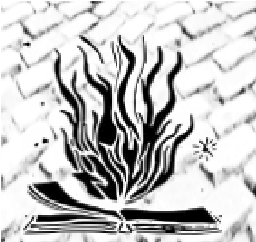
This is our logo

Here I have the same amount of indentation, and it continues the item above.