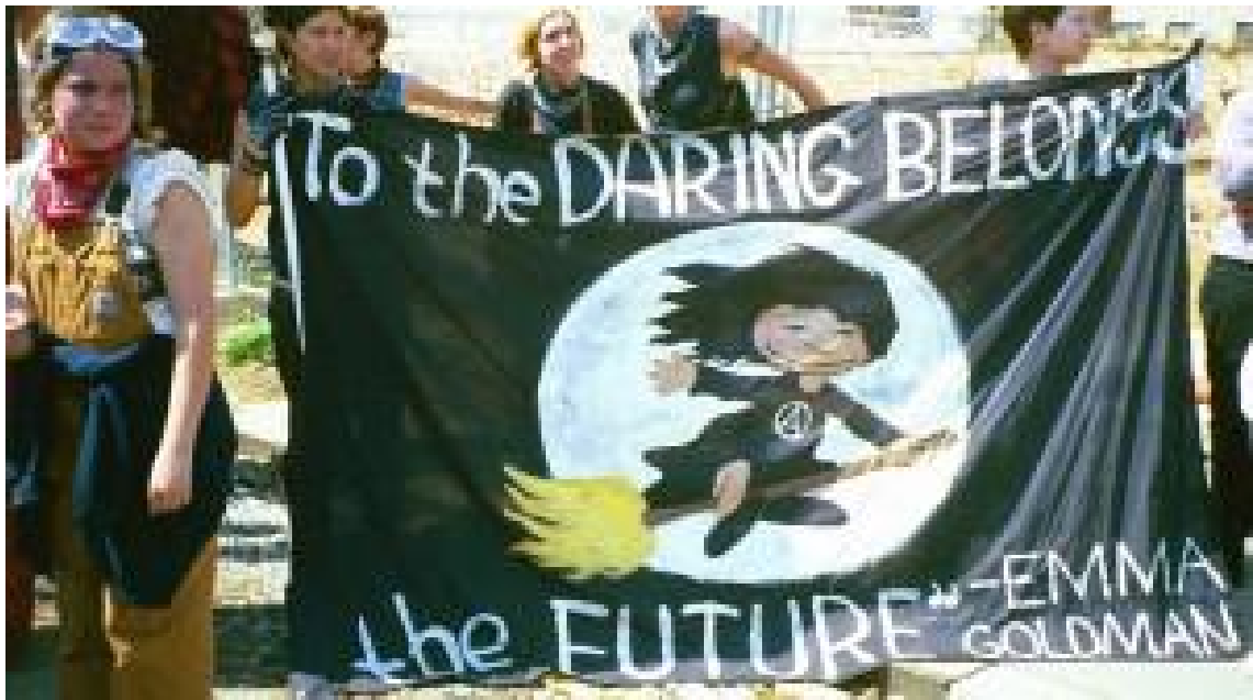
Anarcha-feminists at an anti-globalization rally and protest quote Emma Goldman