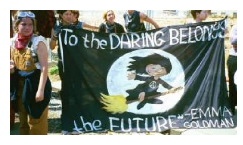
Anarcha-feminists at an anti-globalization rally and protest quote Emma Goldman

But even more striking is the conceptual convergence with the conception of freedom that I have described above. For instance, Kornegger affirms that "liberation is not an insular experience" because it can occur only in conjunction with all other human beings (ibid., 496), which, again, means that freedom cannot but be a freedom of equals. However, this also implies that one cannot fight patriarchy without fighting all other forms of hierarchy, be they economic or political. As Kornegger (2007:493) again put it, "feminism does not mean female corporate power or a woman president: it means no corporate power and no president."