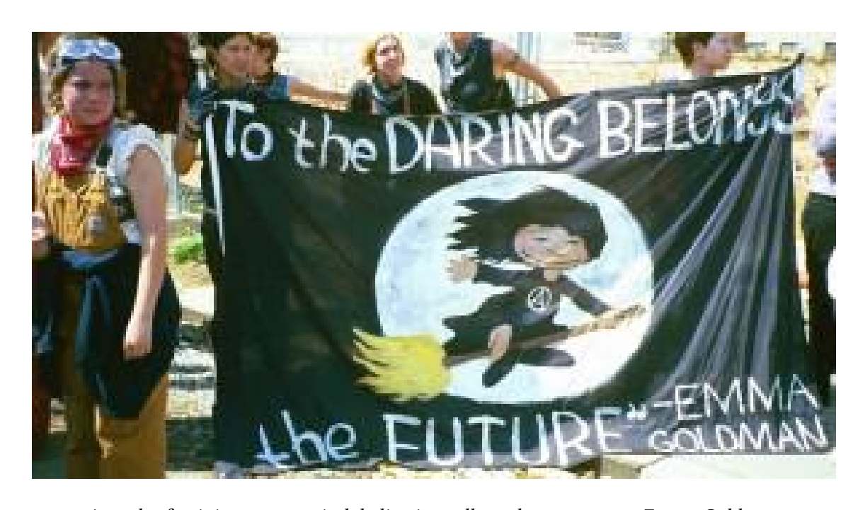
Anarcha-feminists at an anti-globalization rally and protest quote Emma Goldman